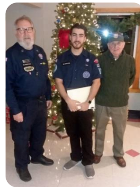
Scout of the Year Post, District, and State Winner