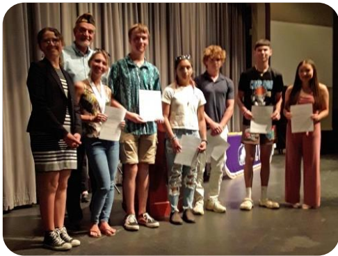
Sequim High School Scholarships