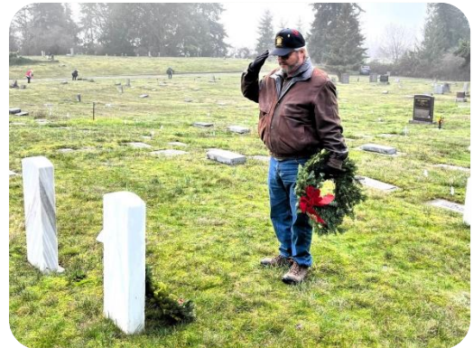
Wreaths Across America