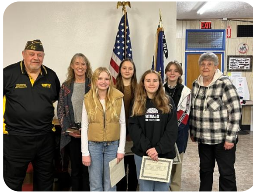
Patriots Pen and Voice of Democracy