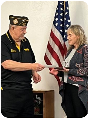
Teacher of the Year