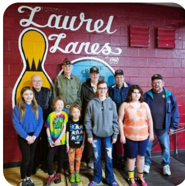
Youth Bowling League