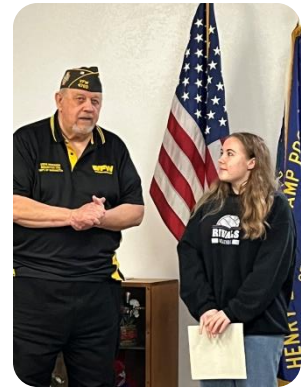
Voice of Democracy Post and District Winner