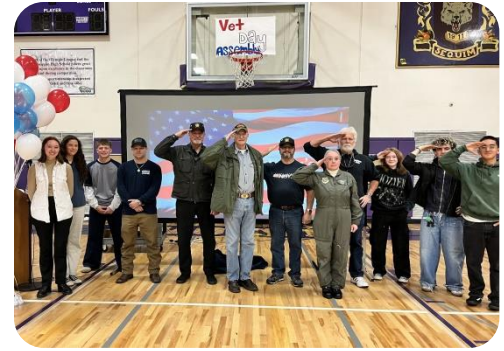
Veterans Day Celebration at Sequim High School