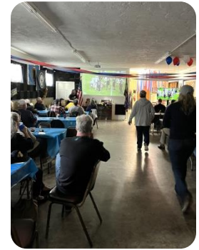
Army/ Navy Football