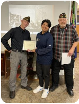
Post and District Patriots Pen Awards